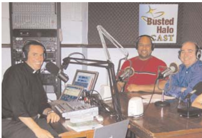
BustedHalo.com's crew produces a podcast for the Paulist-founded web site for young adults.

One project underway in Yonkers, New York is poised to respond to both