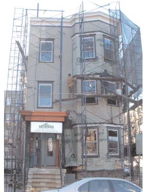
Exterior work nears completion at Westhab's Yonkers project for homeless veterans.