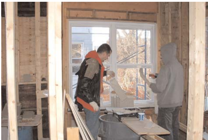
Workers continue renovation work at Westhab's project in Yonkers.

the need for quality housing and supportive services for homeless veterans. Westhab, Inc. is the largest non-profit provider of housing and supportive services for low-income households and the homeless in Westchester County. The agency is nearing completion of 12 single-room units of housing for homeless veterans transitioning from the VA Hudson Valley Healthcare System in Montrose. Once completed, the building near downtown Yonkers will provide 4 individual bedrooms, two full bathrooms, kitchen, dining room and living room on each of its 3 floors, with laundry facilities on the first and top floor, and wheelchair access on the first.